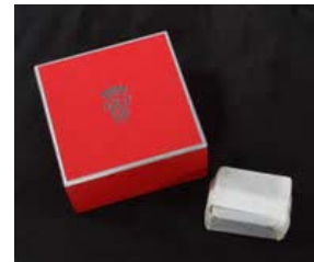
(Prince William & Kate Middleton Wedding Cake)