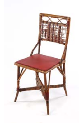
(Casablanca Chair Rick's Café American)