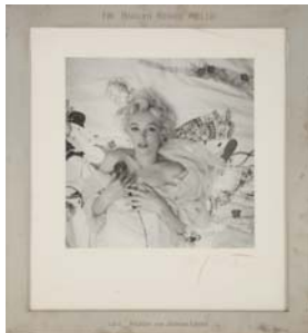
(Marilyn Monroe Cecil Beaton Triptych)