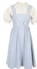
(Judy Garland Wizard of Oz costume)

Included in the auction is one of the most iconic screen worn dress in film history — Judy Garland's blue gingham dress from The Wizard of Oz . As Dorothy Gale, Garland brought the magic of Oz to life. The blue and white pinafore costume (Est: $400,000-$600,000) is one of the only complete costumes known to exist which includes both original blouse and pinafore. Over 100 images relating to The Wizard of Oz including Key book and publicity images with continuity photographs from the film will also be offered.