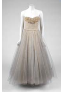
(Elizabeth Taylor “A Place In the Sun” Gown)