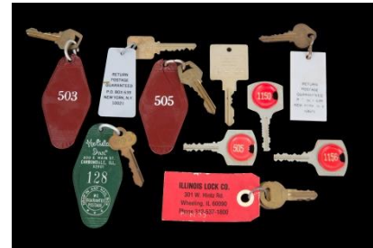
(Travel keys collected by the Zappas)

The auction also includes memorabilia and personal items that document and celebrate the career of Frank Zappa and his love story with Gail. This includes a Dandies Fashions coat worn by Frank Zappa on the July 20, 1968 cover of Rolling Stone magazine (Estimate: $1,000-$2,000); a purple ribbed turtleneck worn by Frank Zappa in 200 Motels (United Artists, 1971) (Estimate: $600-$800); a stage worn vest that Zappa also wore on the back cover of the 1972 album Waka Jawaka ; a collection of career related awards presented to Frank Zappa including various Gold records, a National Academy of Recording Arts and Sciences Lifetime Achievement Award, and a GRAMMY® nomination plaque; a clay Thing-Fish model, a ukulele featured on the Thing-Fish album cover and a collection of hotel keys collected by Frank and Gail in their travels (Estimates: Various).