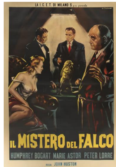
(top photo: Italian The Maltese Falcon poster)

Thursday, March 8, 2018 Property from the Osianama Archives Session I: 11:00 a.m. PST